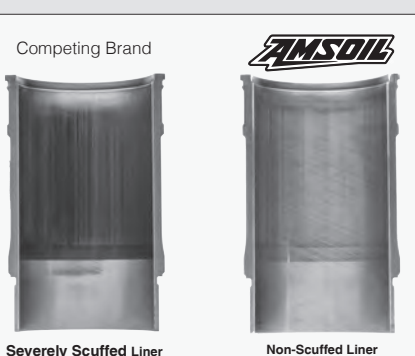
Detroit Diesel DD13 Scuffing Test for Specification DFS 93K222